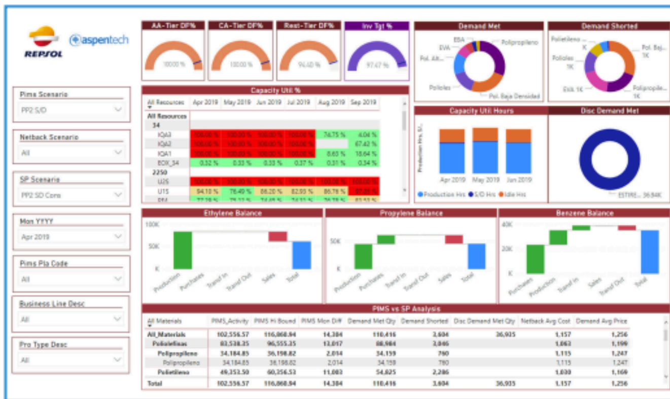
Figure 3. Repsol Control Tower dashboard including capacity utilization, customer service and demand fulfillment, monomer balances, and detailed economics such as netbacks, costs and prices.

Another huge benefit for Repsol was increased profit, enabled by three different initiatives implemented as part of the overall project. First, the amount of prime product was increased by reducing transition time on the polymers units by approximately 3-4% due to scheduling optimization. Second, better decision-making at the crackers resulted from increased visibility into the polymers business demands and constraints. For example, the flexible crackers could switch from LPG to naphtha feedstock, or vice versa, depending on economics and inventory at the downstream polymers units. This translated to a production cost reduction of between 0.7% and 1.3%. Third, full visibility of clients improved marginal sales margin by approximately 4%.