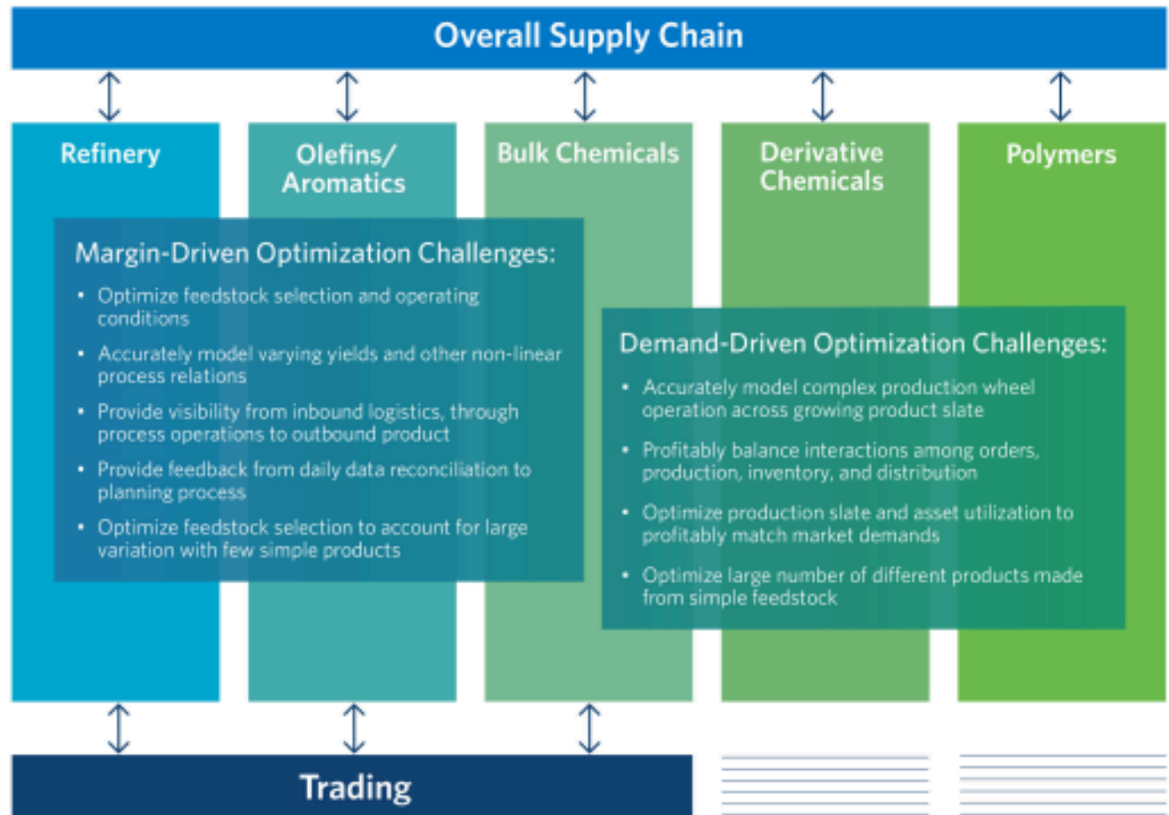
Figure 1. Margin-driven vs demand-driven optimization and challenges in the supply chain.

value from the integrated business requires planning processes and technology which supports both the margin- and demand-driven sides of the business and balances the objectives of each, as shown in Figure 1 below. Balancing these trade-offs shows Repsol’s expertise and maturity in optimizing its business.